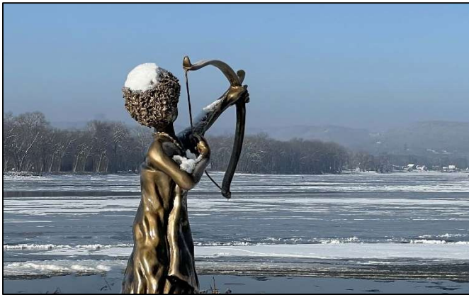
Mississippi River at La Crosse, WI