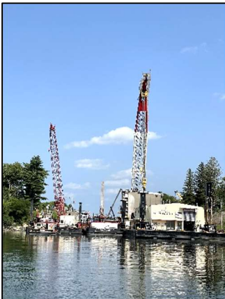
Marseilles Lock 7-23-23