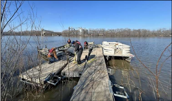
Dockside docks found