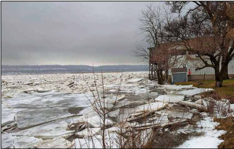
Illinois River at Captain's Cove Bar and Grill January 27, 2024 Arctic subzero weather, near 60 degree temps, more snow, ice jams, flooding..... enough already, bring on spring!