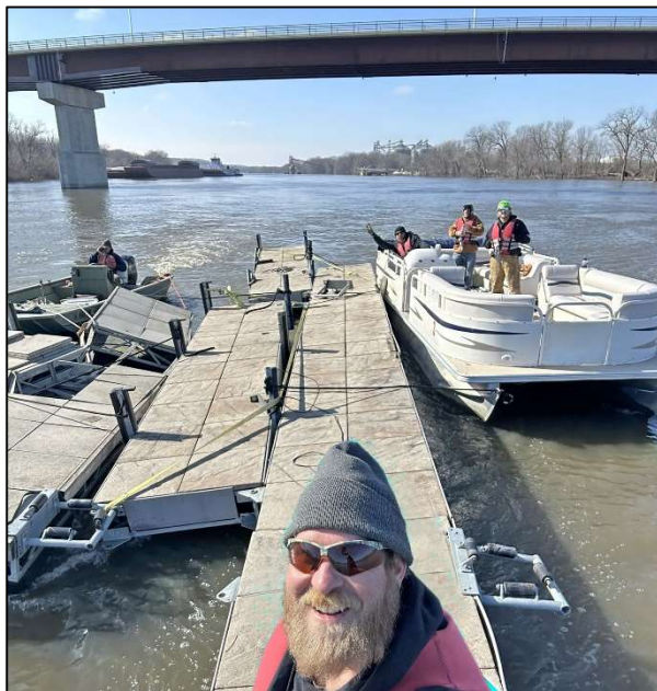
Locking through Starved Rock Lock