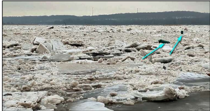
Broken channel markers passing by Starved Rock Marina

The dock rescue turned out to be more than a 12 hour adventure. Because of the high water, permission was needed to launch the rescue boats from the Starved Rock Park side of the dam.