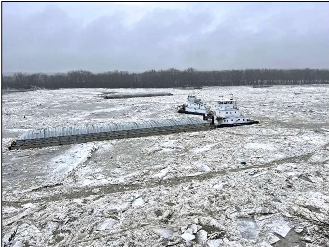
Staging towboats collecting barges that broke free in the ice flow

Dock Rescue – just a week later, 2/3/24, several Wide Waters Yacht Club members decided to rescue the boat docks that were taken out from Dockside Bar and Grill by the ice flow.