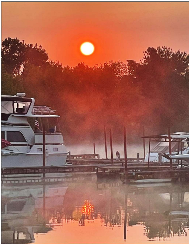
Morning sunrise over Starved Rock Marina